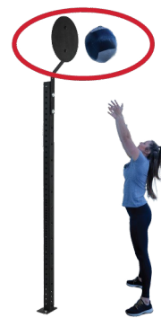
The ball not making contact with the wall target