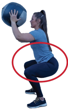
Squatting at or above parallel.