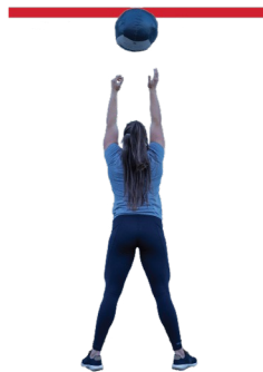
The ball hitting low on the target